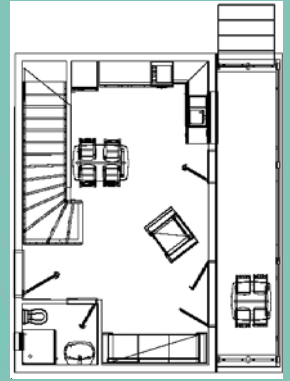
GARDEN VILLAS GROUND FLOOR